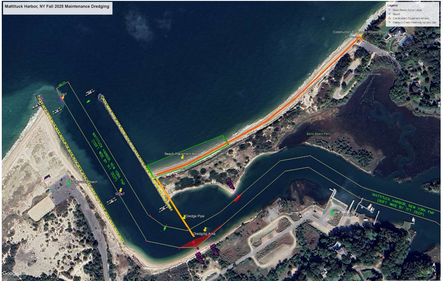
Figure 2: Dredging Work Area Mattituck Harbor, Suffolk County, New York