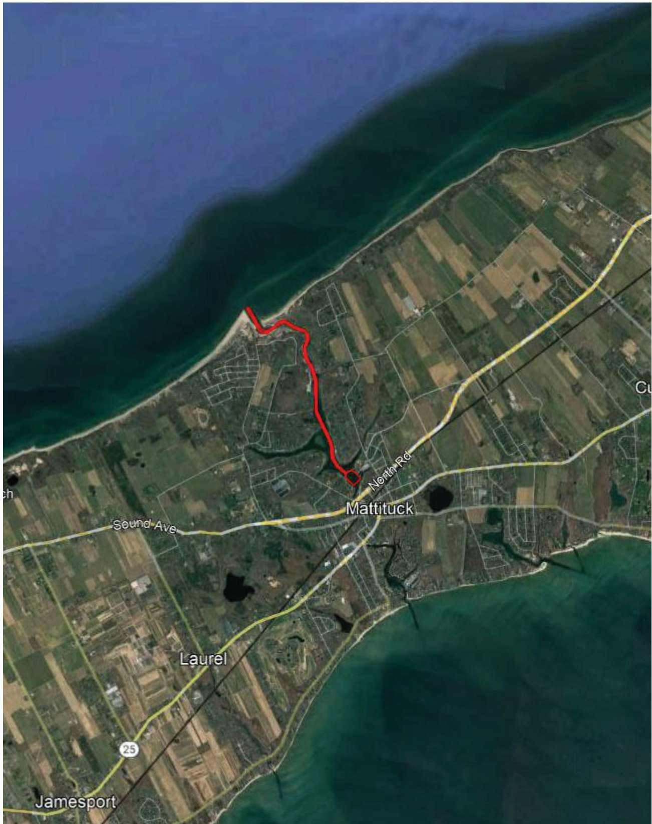
Figure 1: Location Map Mattituck Harbor, Suffolk County, New York